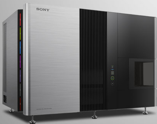
ID7000™ Spectral Cell Analyzer

Learn how the ID7000 Spectral Cell Analyzer has empowered biomedical research